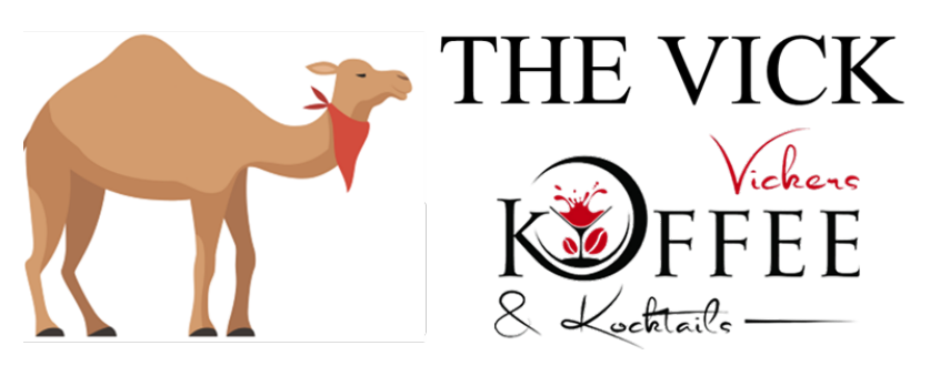
The Vick, 1182 Canton Street, Roswell