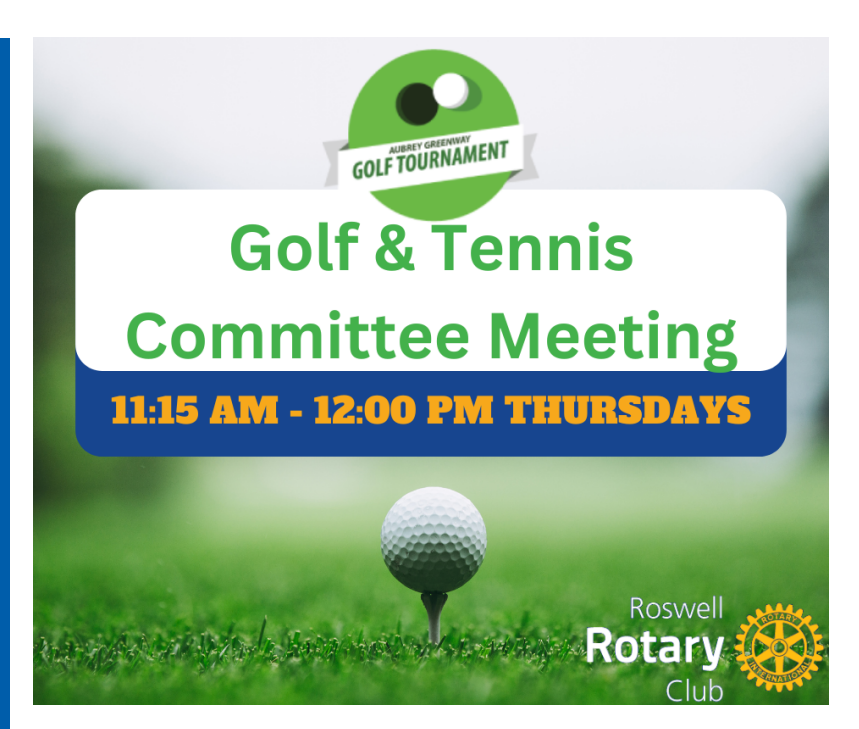
LAST Meeting before the big event! 11:15 am - 12 pm. Thank you for attending!